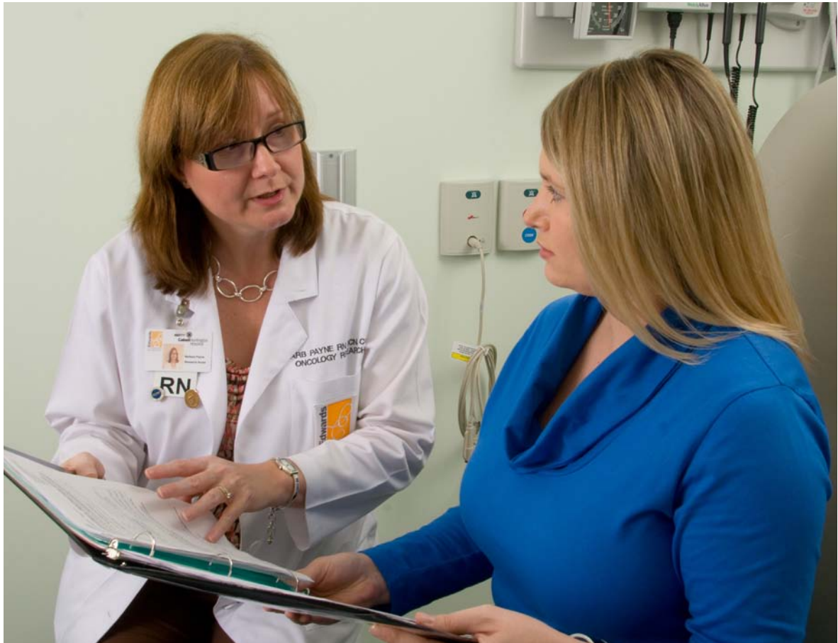
Patients can feel more confident in their caregivers when they receive care from a certified nurse.

Outcome: This past year, three more nurses have earned their certification in oncology. Overall, fifty-one percent of our nurses are now certified, thereby giving us commendation level for this standard during our most recent Commission on Cancer survey.