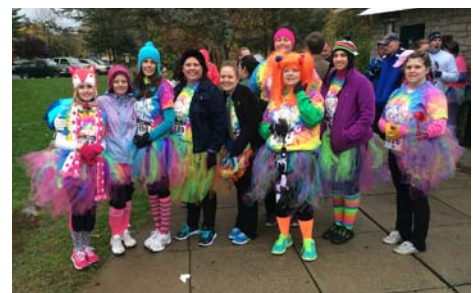
Annual Colors of Cancer 5K Run/Walk, Nov. 1, 2014.

Annual Cancer Survivors' Day Celebration Annual Colors of Cancer 5K Run/Walk Annual Breast Cancer Survivors' Dinner Relay for Life Senior Saturday, church/community health fairs and mall events Free/reduced-cost cancer screenings (breast, lung, pelvic, prostate, skin) Tobacco cessation resources CME programs for physicians, nurses, healthcare providers and allied health personnel