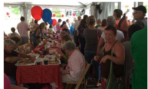
Annual Survivors' Day Celebration, June 1, 2014.