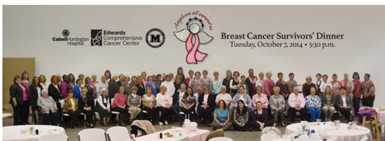
Annual Breast Cancer Survivors' Dinner, Oct. 7, 2014.